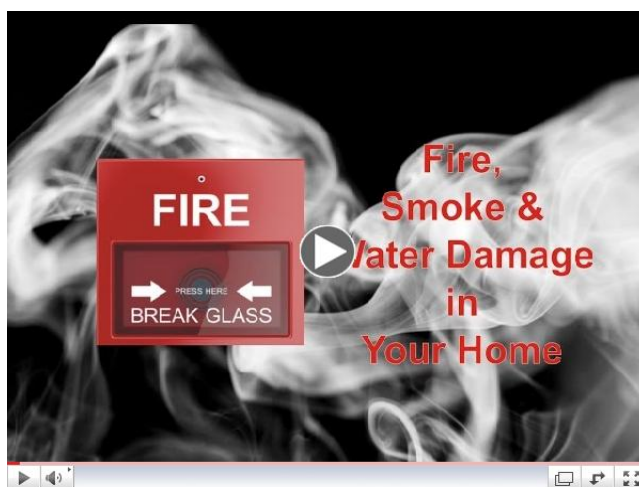
Fire, Smoke & Water Damage in Your Property

CSC recently sponsored a video about fire, smoke and water damage that can be seen here: